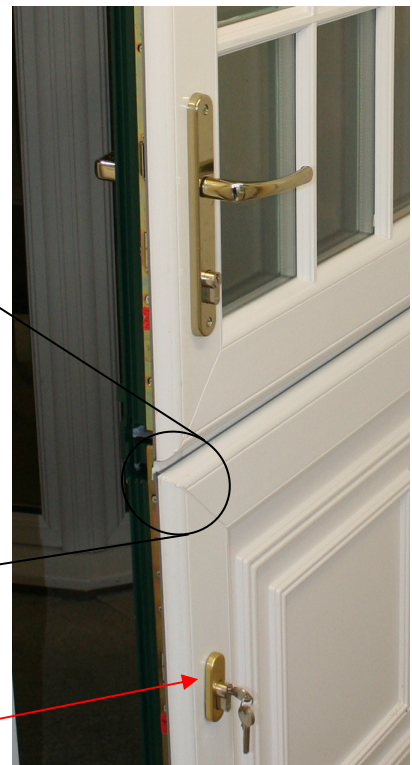
Key locking operation only on bottom door