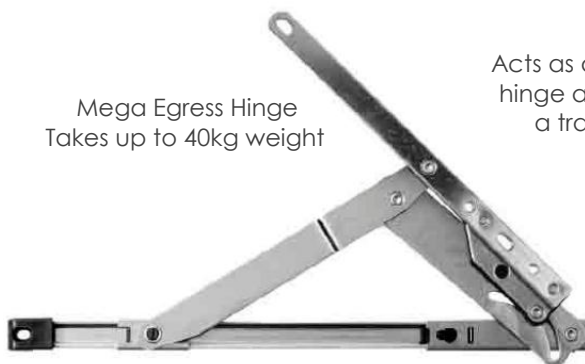
Mega Egress Hinge Takes up to 40kg weight