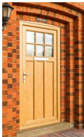
Lincoln (Feature bar)