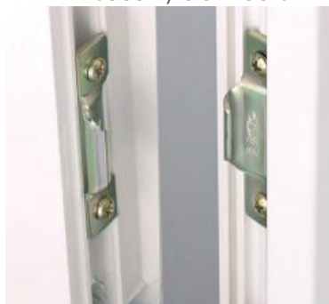
Security claw locks