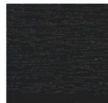
No 10 Black