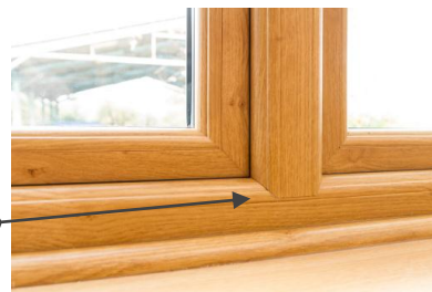
Mechanically joined mullion on an Irish Oak StyleLine frame

✦ Any mullions or transoms are mechanically joined to the outer frames meaning that there are no unsightly weld sprues or "V" grooves in the profile.