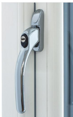
Inline and Offset

✦ The looks of the StyleLine system are complemented by the style and colours of handles that are available for the range.