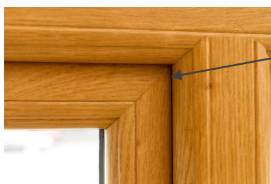
Seamless weld on the inside of an Irish Oak StyleLine sash

✦ All the welded corners (frame and sashes) are done on the new Graf welder which produces a seamless weld with no external weld sprues on laminated profiles and a very fine 1.5mm pencil line finish on the standard non-laminated white profiles. In effect the outer frame looks like it has been cut and glued so there are no ugly external sprues that have to be knifed/cleaned off, giving the end user a smooth, easy to clean, seamless StyleLine finish.