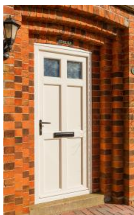
Croxby (Glazed top)