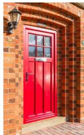
Lincoln (Feature bar)