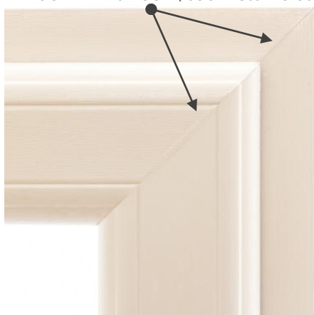
External View of cream laminated window with smooth, seamless welds